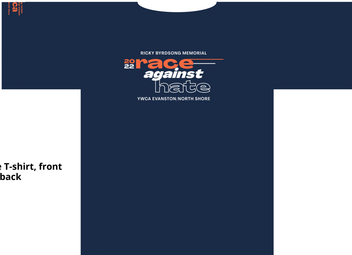
Race T-shirt, front and back